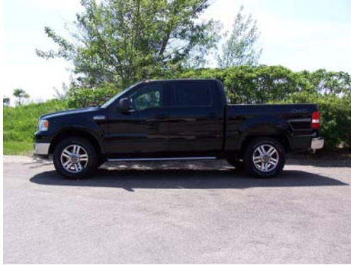
Vehicle BEFORE Installation