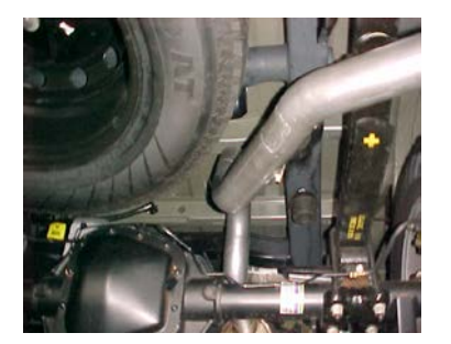
INSTALL OVERAXLE TAILPIPE #C INTO MUFFLER 1 ½" TO 2". INSERT HANGERS INTO RUBBER GROMMETS.USE CLAMP #E TO SECURE PIPE TO MUFFLER.DO NOT TIGHTEN.

TO REMOVE YOUR STOCK EXHAUST, REMOVE IT FROM THE 2 BOLT FLANGE LOCATED JUST IN FRONT OF THE MUFFLER AND REMOVE HANGERS FROM RUBBER GROMMETS BY PULLING EXHAUST TOWARDS THE REAR OF THE VEHICLE, USE WD-40 TO AID IN REMOVAL, LEAVE GROMMETS IN PLACE.