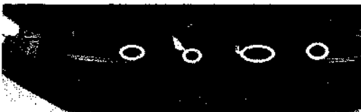
4 large pins

Install videos at customautoworksstore.com