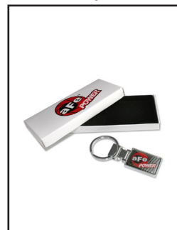
aFe Key Chain