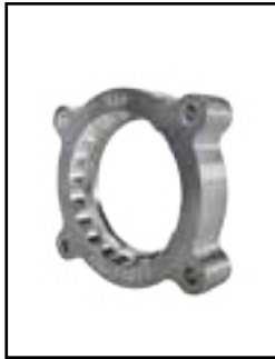
Throttle Body Spacer