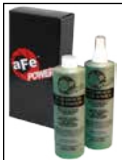
Pro DRY S Restore Kit