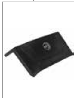
Intake System Cover