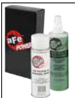
Blue Aerosol Restore Kit