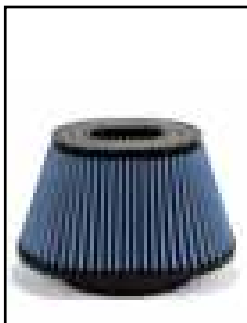
Pro 5R Air Filter