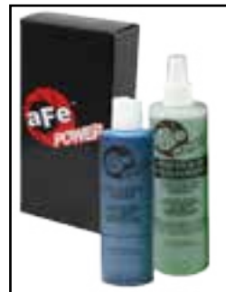
Blue Squeeze Restore Kit