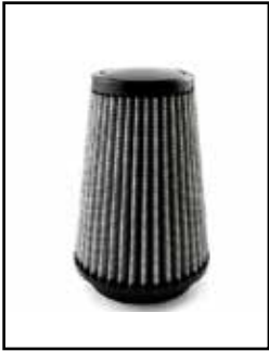
Pro DRY S Air Filter