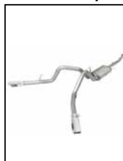
Cat-Back Exhaust System