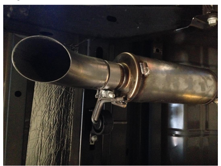
Step 4. Install both the Turn Down Tip with the supplied 2.50" clamp.