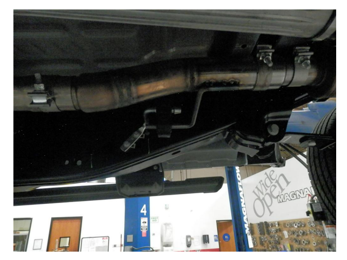
Step 2. Install the new system by attaching the Inlet Pipe Assembly to the resonator outlet pipe using the existing clamp. Locate the welded hanger to the rubber insulator. Leave all clamps and fasteners loose for final adjustment of the complete system once installed.