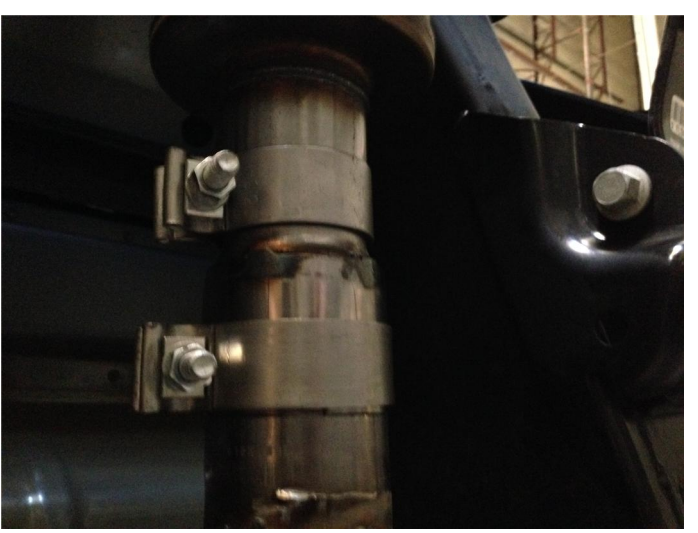
Step 3. Install the Extension Pipe between the Inlet Pipe Assembly and the Muffler Assembly using the supplied 3.00" and 2.50" clamps. Engage the welded hanger to the rubber insulator.