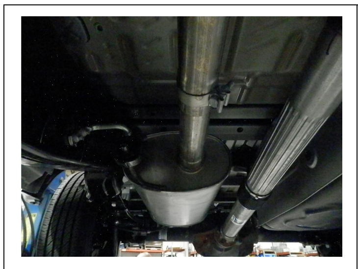
Step 1. To remove the OEM exhaust system, loosen the clamp attaching the systems inlet pipe to the resonator outlet pipe. Disengage all welded hangers from the OEM rubber insulators. Do not discard the OEM clamp or damage the rubber insulators as they will be needed to mount your new MAGNAFLOW system.