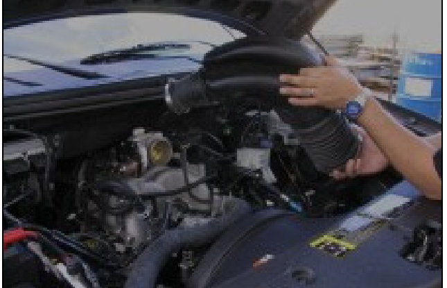
3. Remove the factory intake tube assembly from engine.