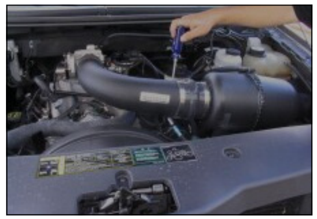
8.. Tighten hose clamps on both ends of the Modular Intake Tube.