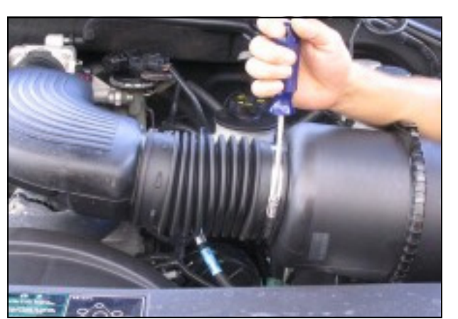
2. Loosen hose clamps connecting the factory intake tube to the air filter assembly and throttle body.