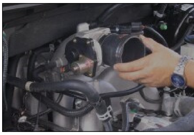
6. Install supplied silicone reducer on end of throttle body. Install #48 hose clamp on small end of the reducer and #56 hose clamp on the big end of the reducer. Leave hose clamps loose until final assembly.