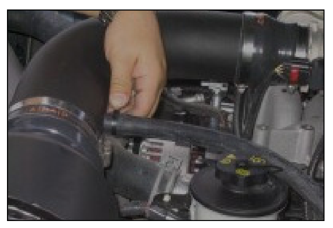
9. Install the supplied rubber hose on the Modular Intake Tube. Connect the other end of the hose to the valve cover. Secure both ends of the hose with the supplied speed clamps.