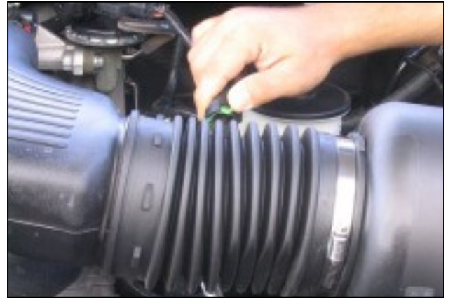
1.Disconnect The Negative Battery Terminal! Disconnect valve cover breather hose from factory intake tube and valve cover.