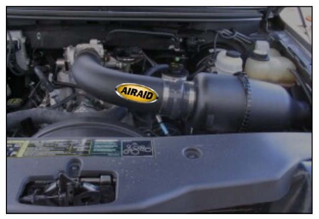
10. Double check your work to be certain that all nuts, bolts, and clamps are securely fastened. Apply the Airaid Bubble Decal onto the Intake Tube as shown.

Thank you for purchasing the Airaid Intake System. Contact Airaid @ (800) 498-6951 8:00 AM - 5:00 PM MST weekdays for questions regarding fit or instructions that are not clear to you. Your Airaid Intake System was carefully inspected and packaged. Check that no parts are missing, or were damaged during shipping. If any parts are missing, contact Airaid. The air filter element is protected from direct exposure to water and debris; care should be taken not to drive through deep water. WATER INGESTION IS THE DRIVERS RESPONSIBILITY! The air filter is reusable and should be cleaned periodically.