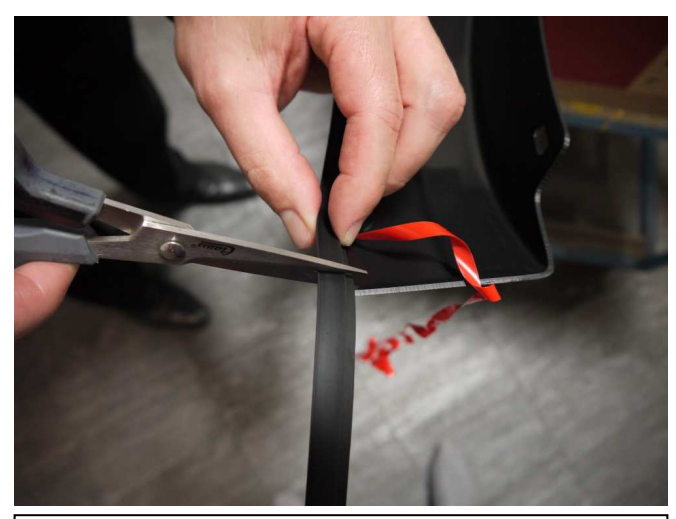
STEP 4: Trim any unnecesary extrusion and discard.