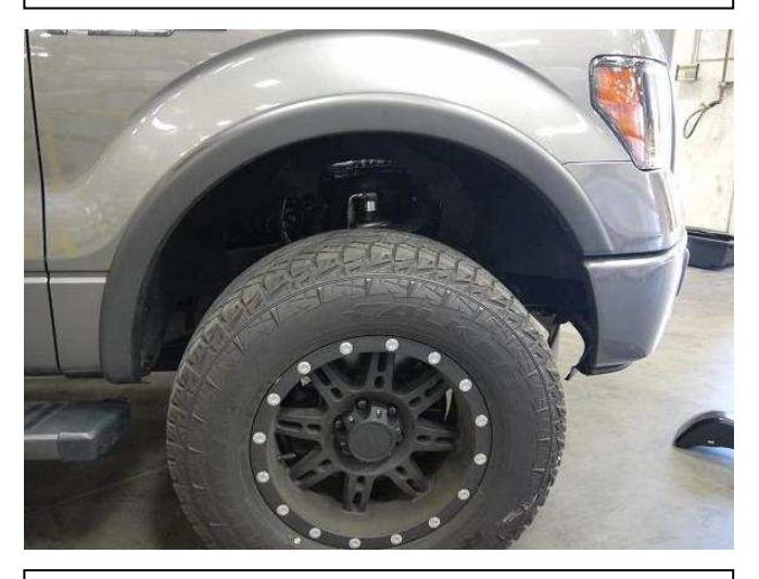
STEP 5: Clean the body areas where the Fender Flares will makes contact. Use the supplied alcohol wipe.