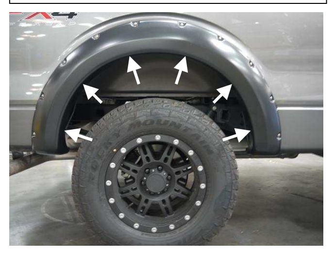
STEP 12: Place the Fender Flare onto the vehicle and fit into the correct position following the contours of the body. Use twelve (12) of the .6mm clips (six (6) per side) to secure the Fender Flare to the body. Make sure the dimple in the clip securely attaches in the slot on the Fender Flare.

For models equipped with factory fender flares, removal of factory flares is required, please consult the vehicle service manual for factory fender flare removal.