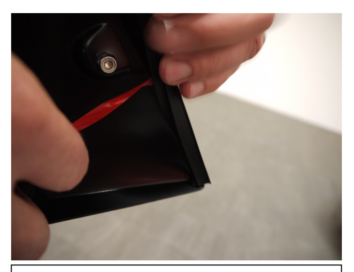
STEP 3: Pulling at right angles to the extrusion, remove the liner from the extrusion in small portions and apply thumb pressure to ensure that it adheres to the Fender Flares.

Installation Instructions Bolt-On Fender Flares Ford F150 (09-12) Part #17394