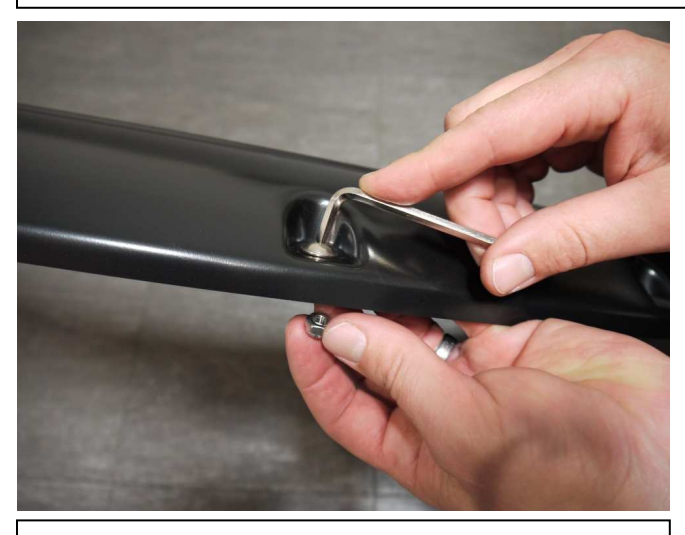
STEP 1: Attach 9 bolts to each Fender Flare using a 5/32" Allen key and a 3/8" wrench/socket. (wrench/socket and Allen key not supplied)

PAINTING INSTRUCTIONS – If Fender Flares are being painted; do not install edge extrusion until painting is complete. Prior to painting, clean all surfaces to be painted using clean water and a mild detergent, do not use lacquer thinner or any solvent based products. Wipe completely dry. Best results will be achieved by wiping the areas to be painted with a tack rag just prior to painting. Most automotive paints can be applied directly to the Fender Flares, however some may require a primer (check paint manufacturer specifications). Good adhesion will be achieved without sanding. Select a paint (and primer if necessary) that is suitable for rigid plastics PMMA (Acrylic). If using a paint system that requires baking, do not expose the product to temperatures above 70°C (158°F). Do not fit the extrusion or any of the hardware to the Fender Flares until the paint is completely dry.