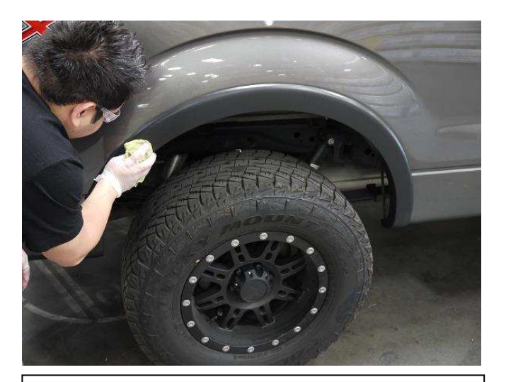
STEP 11: Clean the body areas where the Fender Flares will makes contact. Use the supplied alcohol wipe.

For models equipped with factory fender flares, removal of factory flares is required, please consult the vehicle service manual for factory fender flare removal.