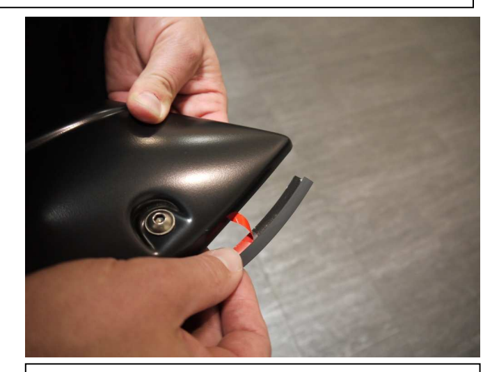
STEP 2: Attach the included rubber seal to the Fender Flares. Peel back 2" of the adhesive backing and position on the Fender Flare. Attach the seal to the Fender Flare, peeling back a few inches at a time. Attach rubber seal along all areas the Fender Flare will make contact with the vehicle body.