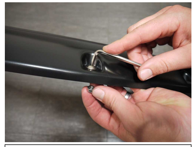
STEP 9: Attach 10 bolts to each Fender Flare using a 5/32" Allen key and a 3/8" wrench/socket. (wrench/socket and Allen key not supplied)