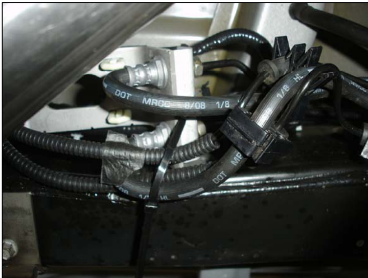
Fig # 2

Step 4: Once a final position has been chosen for the new system, evenly tighten all fasteners from front to rear. The supplied band clamps must be VERY tight to properly align the pipes and prevent leaks (Approximately 40ft-lbs). Inspect all fasteners after 25-50 miles of operation and retighten if necessary.