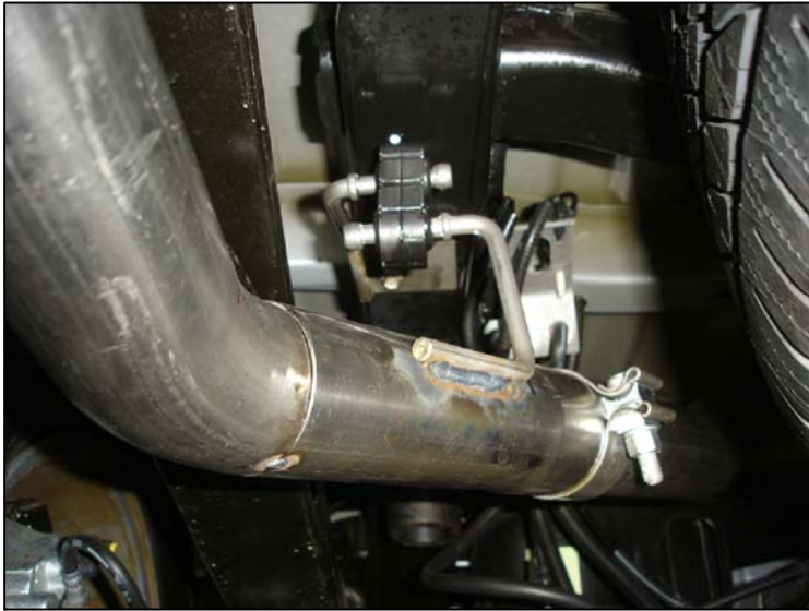
Fig # 1

Step 3: With all components mounted loosely, adjust the system for overall aesthetics and clearance of frame & bodywork. (MAGNAFLOW recommends at least 1/2" of clearance between the exhaust system and any body panels to prevent heat-related body damage or fire.)