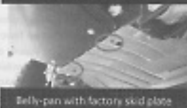
Belly-pan with factory skid plate

Loosen or remove factory 2 front skid plate bolts, re-attach after bumper is installed