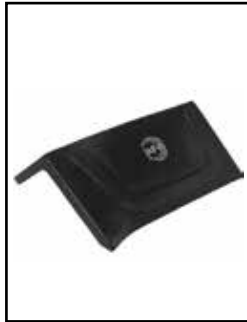
Intake System Cover