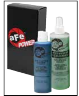
Blue Squeeze Restore Kit