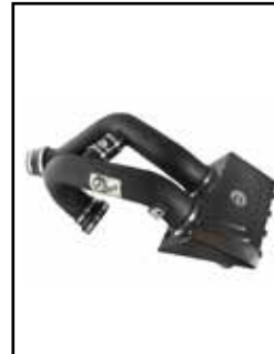
Magnum Force Intake