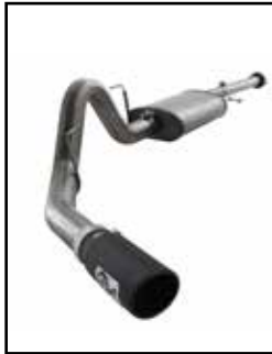
Cat-Back Exhaust System