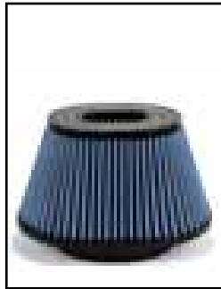
Pro 5R Air Filter