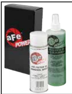
Blue Aerosol Restore Kit