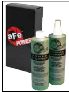
Pro DRY S Restore Kit