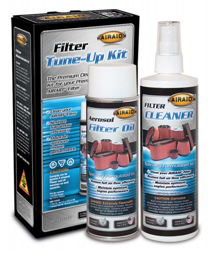
P/N 790-551 Aerosol Spray P/N 790-550 Squeeze Spray