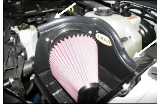
8. Install the Airaid Premium Filter (#1) onto the adapter tube and tighten the hose clamp. Next install the weather strip (#5) onto the top of the Quick Fit panels as shown.