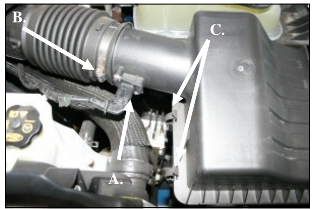
1. Disconnect the negative battery cable! A.) Using the provided #20 Torx Bit remove two screws and the Mass Air Flow (MAF) sensor from the factory intake tube. There is no need to disconnect the wiring harness.

Full color instructions can be viewed on our web site at Airaid.com. If you need any assistance please call 1-800-858-3333 to speak with a representative in our Customer Service Center before returning the product.