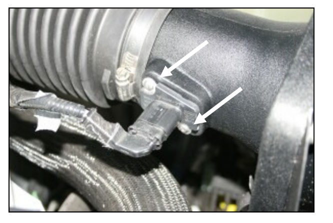
7. Reinstall the MAF sensor into the Airaid Adapter Tube using two 8-32 x 3/8" button head screws (#11). Do Not Use The Factory Screws !

5. Install the MAF Adapter Tube (#2) into the Quick Fit Panel as shown using four 1/4-20 button head bolts (#9) and flat washers (#10). Make sure the slot for the MAF sensor is on the left side when looking from this view.