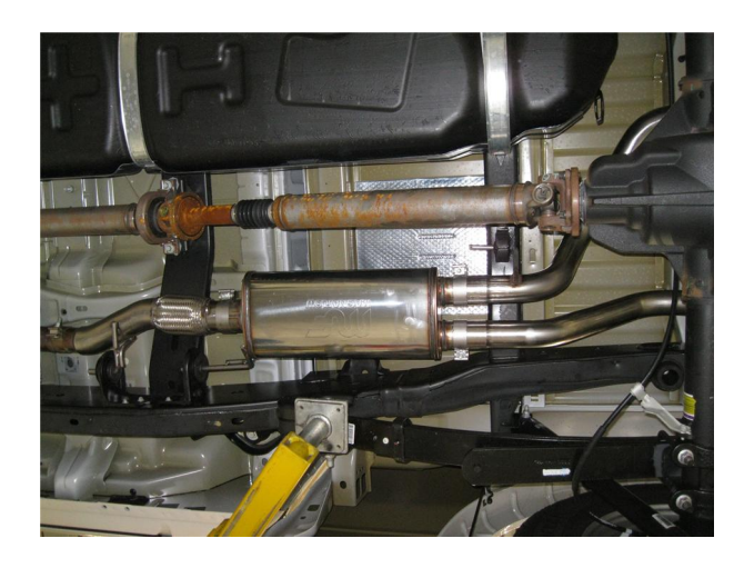
Step 2. To begin, fasten the Inlet Pipe Assembly to the catalytic converter using the OEM clamp assembly and by fitting the welded hanger into the OEM rubber insulator (Leave all clamps and fasteners loose for final adjustment of the complete system.) Install the Muffler to the Inlet Pipe Assembly using the supplied 3.00" clamp. Next install the Tailpipe Extensions to the Muffler in the similar fashion using the supplied 2.50" clamps.

Unfasten the clamp attaching the OEM muffler inlet to the OEM catalytic converter. Do not damage or discard the OEM fasteners or rubber insulators, as they will be reused to mount the new system. Disengage the muffler hangers and remove the OEM exhaust from the vehicle.