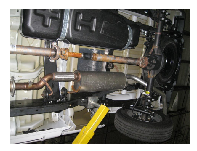
Step 1. The new exhaust system requires that you permanently remove the spare tire from the vehicle. To remove the OEM exhaust system, you will to need to cut the pipe beind the muffler before it goes over the axle. You can then disengage the welded hangers from the OEM rubber insulators and remove the tailpipe.

Unfasten the clamp attaching the OEM muffler inlet to the OEM catalytic converter. Do not damage or discard the OEM fasteners or rubber insulators, as they will be reused to mount the new system. Disengage the muffler hangers and remove the OEM exhaust from the vehicle.