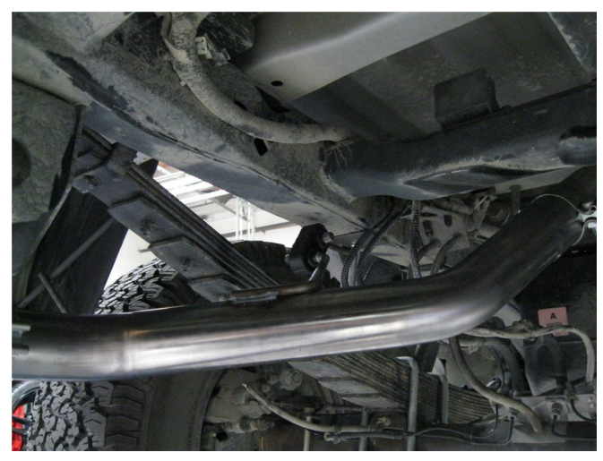
Step 3. Next you will need to use the supplied U-Nuts and attach them to the recieving cut outs in the bottom of the frame rail. Fasten the supplied hanger assemblies to the frame members using the supplied bolts on both the Driver and Passenger side. Install the Tail Pipe Assemblies to the Tail Pipe Extensions using the supplied 2.50" clamp, fitting the welded hangers into rubber insulators.