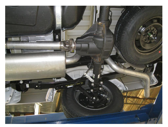
Step 1. The new exhaust system requires that you permanently remove the spare tire from the vehicle. To remove the OEM exhaust system, you will to need to cut the pipe beind the muffler before it goes over the axle. You can then disengage the welded hangers from the OEM rubber insulators and remove the tailpipe. Unbole the flange attaching the OEM Resonator to the catalytic converter. Do not damage or discard the OEM fasteners or rubber insulators, as they will be reused to mount the new system. Disengage the muffler hangers and remove the OEM exhaust from the vehicle.