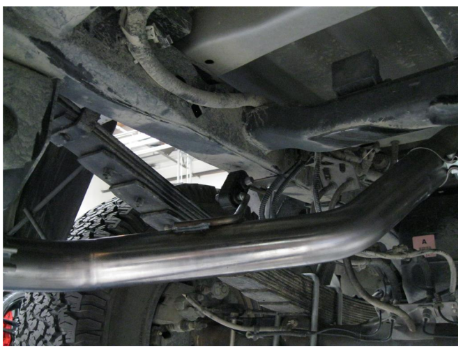
Step 3. Next you will need to use the supplied U-Clip nut and attach them to the recieving cut outs in the bottom of the frame member. Fasten the supplied hanger assemblies to the frame members using the supplied bolts on both the Driver and Passenger side. Then install the Tail Pipe Assemblies to the Tail Pipe Extensions using the supplied 2.50" clamp, fitting the welded hangers into rubber insulators.