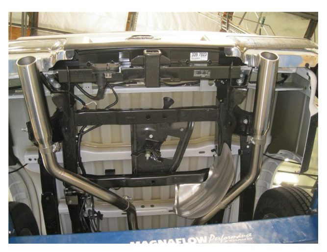
Step 4. Lastly, install the tips to the Tail pipe Assemblies using the supplied 2.50" clamps. The supplied adjustable tips are design to fit a variety of aftermarket bumpers and rollpans, once a position is decided for the tips it is recommended to have them welded into place.