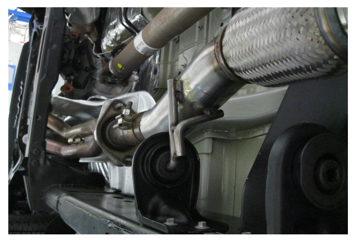
Step 4. Locate the welded hangers to the rubber isolators. Working front to rear use a similar technique to install the Pipe Extension, Muffler Assembly and Tip.