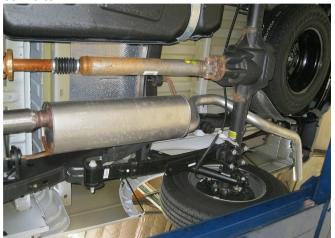
Step 2. Working front to rear loosen all connecting band clamps. Carefully remove the welded hangers from the rubber isolators. The OEM system can now be removed. Be sure to retain all mounting hardware as it will be needed to install your new MAGNAFLOW performance exhaust system.