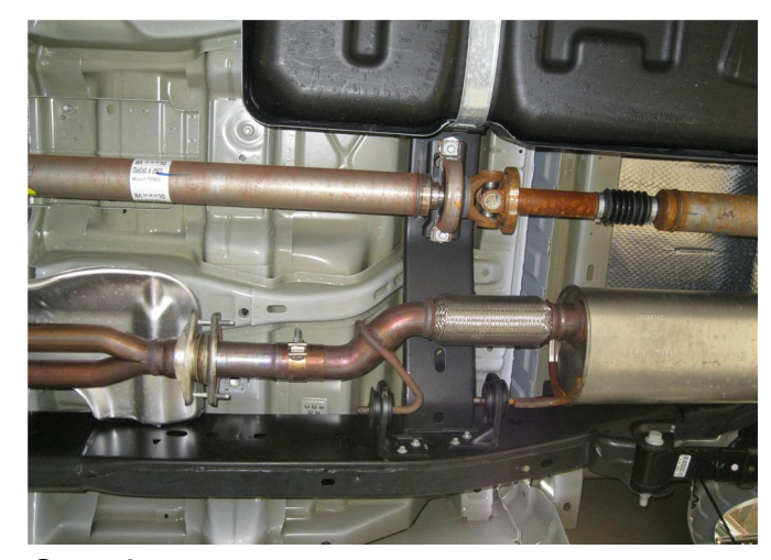
Step 1. Remove the OEM system by first loosening the clamp attaching the stock inlet pipe to the catalytic converter.