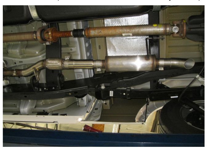
Step 5. Once a final position has been chosen for the new exhaust system, evenly tighten all clamps from front to rear using the torque specifications on page one of the instructions. Inspect all fasteners after 25-50 miles of operation and re-tighten if necessary.