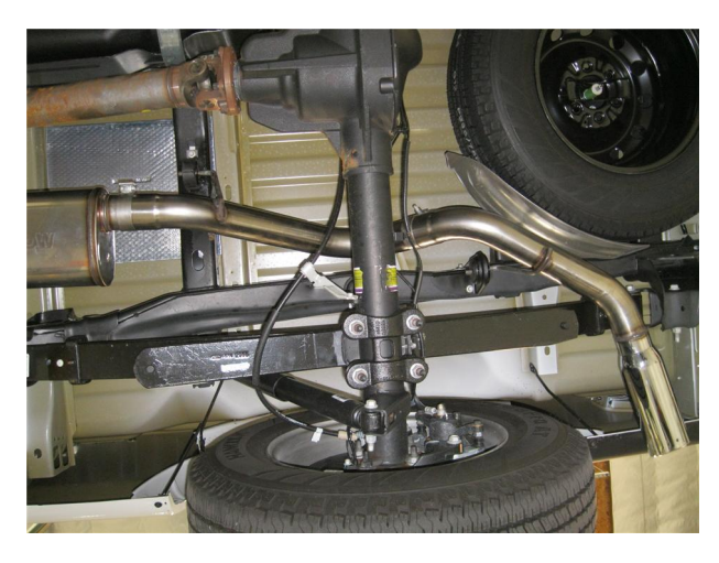
Step 3. Finish by installing the Tail Pipe Assembly to the Tail Pipe Extension using the supplied 3.00" clamp, fitting the welded hanger into rubber insulator.