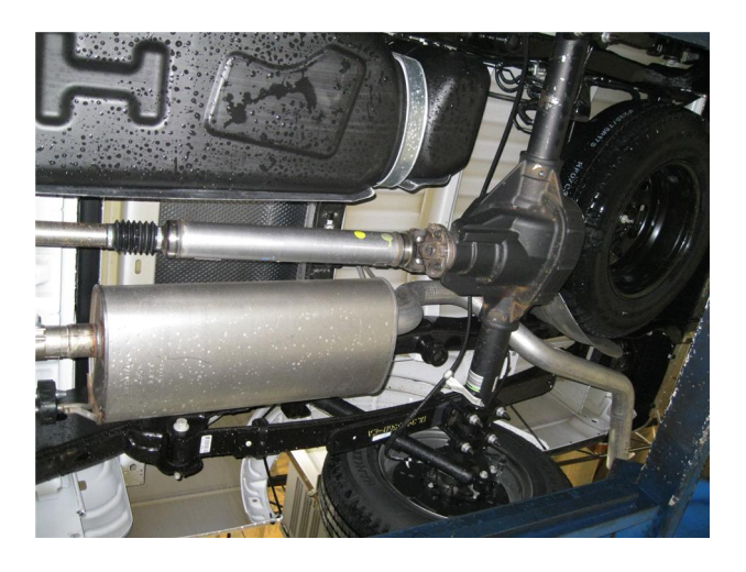
Step 1. To remove the OEM exhaust system, you will to need to cut the pipe beind the muffler before it goes over the axle. You can then disengage the welded hangers from the OEM rubber insulators and remove the tailpipe. Unfasten the clamp attaching the OEM inlet pipe assembly to the OEM catalytic converter. Do not damage or discard the OEM fasteners or rubber insulators, as they will be reused to mount the new system. Disengage the inlet pipe assembly hanger and remove the OEM exhaust from the vehicle