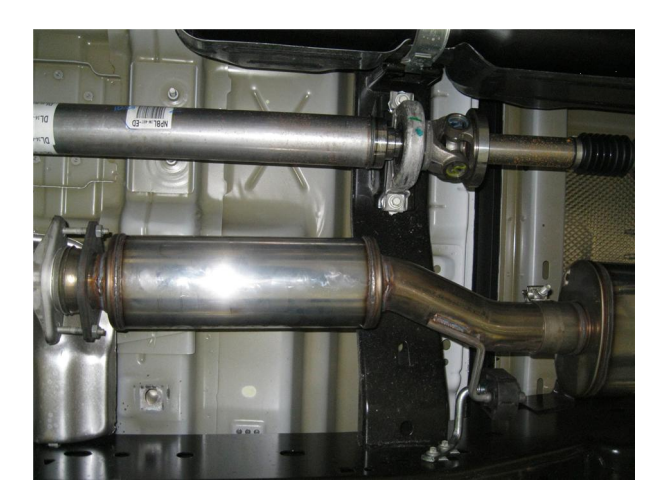
Step 2. To begin, fasten the Inlet pipe assembly to the catalytic converter using the provided 10mm nuts, the OEM clamp assembly and by fitting the welded hanger into the OEM rubber insulator (Leave all clamps and fasteners loose for final adjustment of the complete system.) Install the Muffler to the Inlet Pipe Assembly using the supplied 3.00" clamp. Next install the Tailpipe Extension to the Muffler in the similar fashion using the supplied 3.00" clamp.