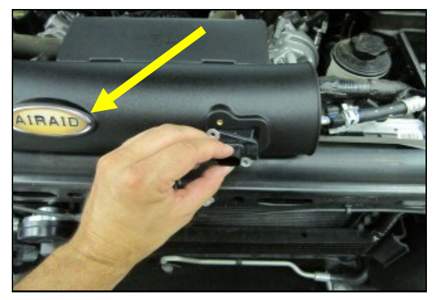
8. Apply the Airaid Decal as shown. Transfer the MAF sensor into the Airaid Intake Tube (#2) and secure using two 8-32 x 1/2" button head screws (#11). Do Not Use The Factory Torx Head Screws !