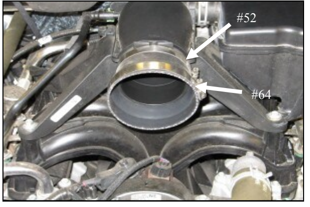
7. Install the Silicone Coupler (#6), one #64 Hose Clamp(#14), and the #52 Hose clamp (#13) onto the engine air inlet. Leave the clamps loose for now.

B.) Install the assembly onto the lower half of the factory airbox. Slide the metal tabs into the airbox slots, and fasten the 3 airbox clips.