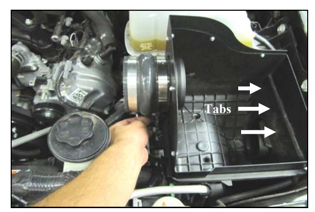
6. A.) Install the Silicone Hump Hose (#7) and two #64 Hose Clamps(#14) onto the Quick Fit assembly