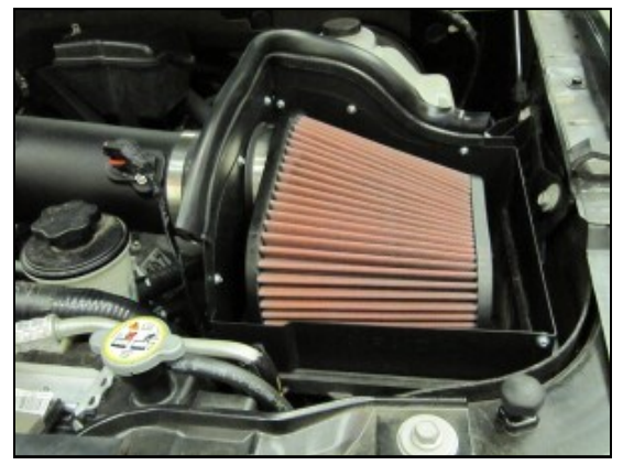
10. Install the Airaid Premium Filter (#1) to the mounting flange inside the quick fit assembly. Complete the installation by attaching the Weather Strip (#5) to the top of the panels as shown.