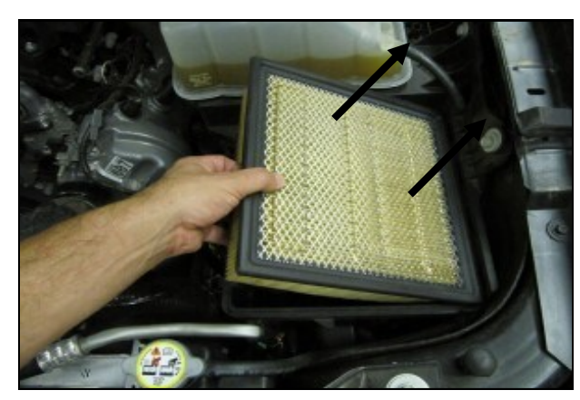
3. Remove the factory air filter from the lower half of the airbox.