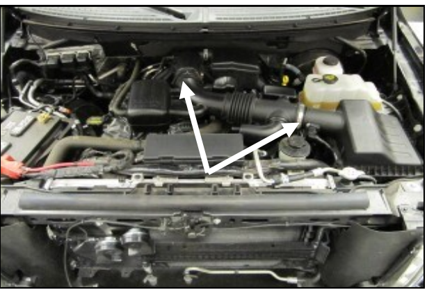
1. Disconnect the negative battery cable! Loosen the two intake clamps and remove the Factory intake tube.

Full color instructions can be viewed on our web site at Airaid.com. If you need any assistance please call 1-800-858-3333 to speak with a representative in our Customer Service Center before returning the product.