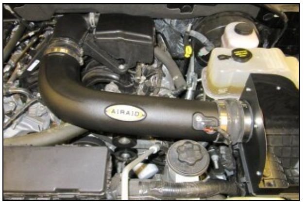
9. A.) Insert the Airaid Intake Tube into the couplers as shown. Check for alignment, and tighten all clamps.

B.) Re connect the Mass Air Flow Sensor.