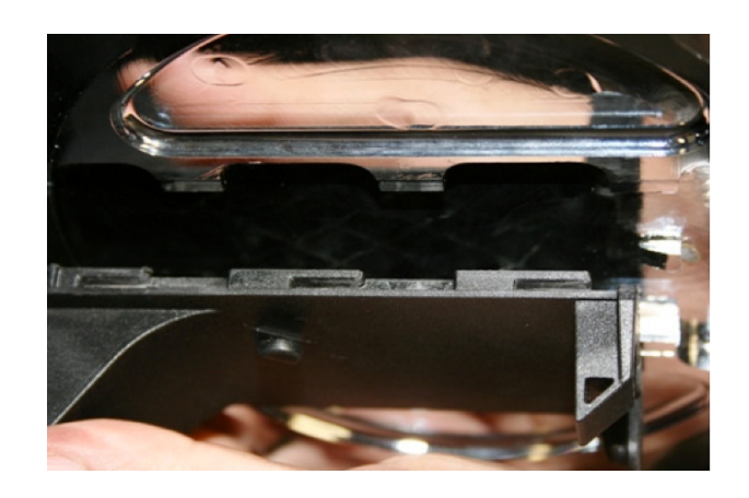
Step 3: Close the door and enjoy your brand new DefenderWorx fuel door!