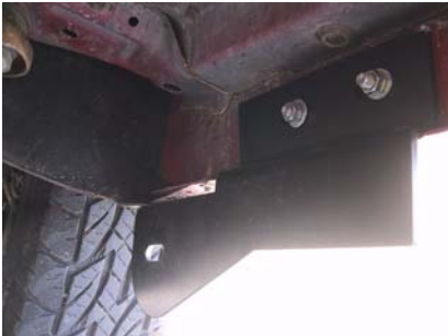
Figure 3 Passenger Side Front

Step 3: Place the front and rear brackets on the truck where you placed the bolt plates shown in figure 3 & 4.