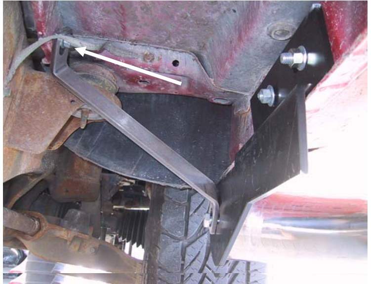
Figure 7 Passenger Side Front

Step 6: Attach the front support strap shown in figure 7 to the body of the truck. Note in the picture there is an arrow showing where you will need to place your 3/8" bolt with washer through the slot to attach the bracket from the body of the truck to the front bracket.