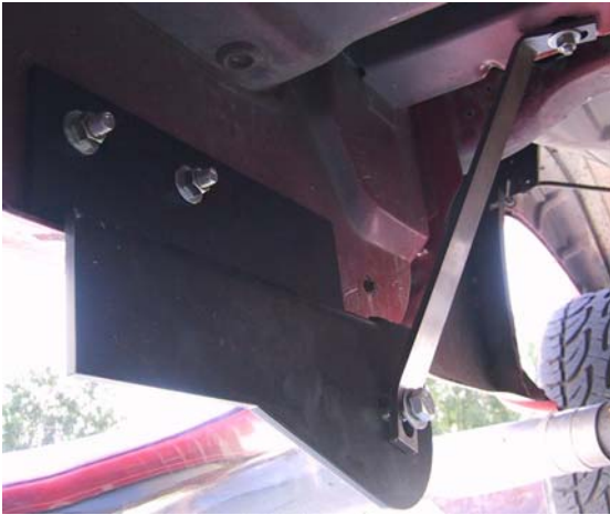
Figure 6 Passenger Side Rear

Step 5: Attach the rear support strap to the bolt plate you installed in step 4 using the 3/8" washer, lock washer and nut. Then leaving everything loose attach the other end of the support strap to the rear bracket. In order to attach this bracket you will need to use the 3/4" bolt, washer, and lock washer to mount to the Boss Bar shown in figure 6. (Note: Prior to installing Boss Bars place the black caps on the end of the bars.)