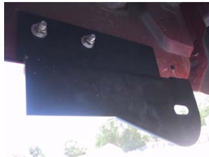
Figure 4 Passenger Side Rear