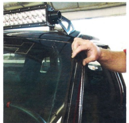
12. Route power wire down windshield and wire light bar as noted in light bar instructions. We recommend using some black silicone on the bottom of the wire holding it down in place.