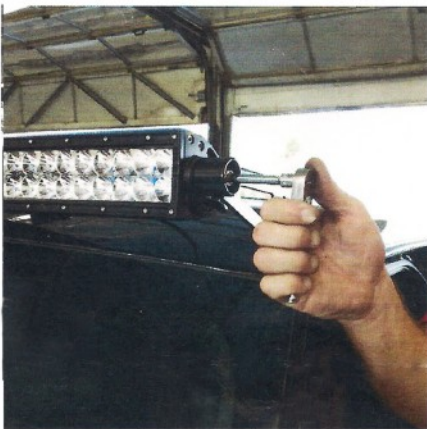
10. Fasten light to passenger side LRM bracket. Drop driver side down and align with holes.