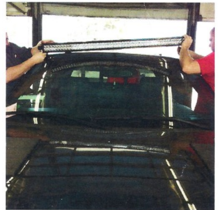
9. Slide opposite side of light bar into passenger side bracket.