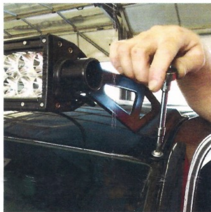
11. Install bolts into bracket and adjust light bar to be level. Torque down all hardware.