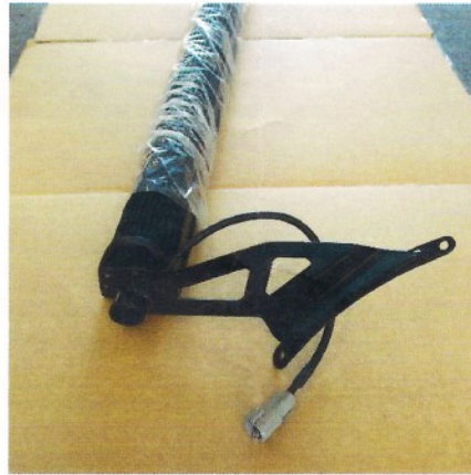
8. Install driver side bracket onto LED light bar using light bar hardware.