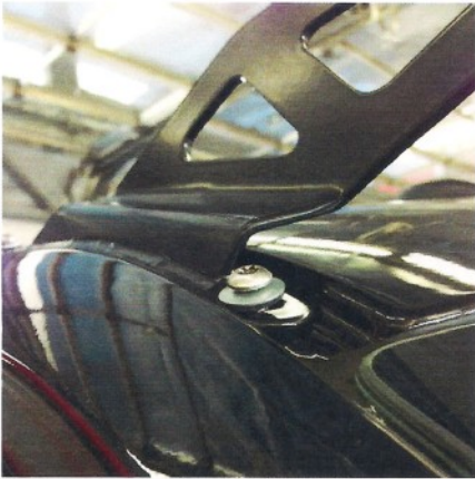
7. Bracket should look like this.