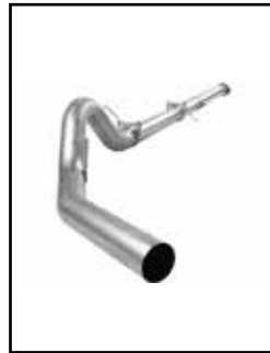
Cat Back Exhaust