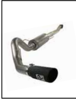
Cat Back Exhaust