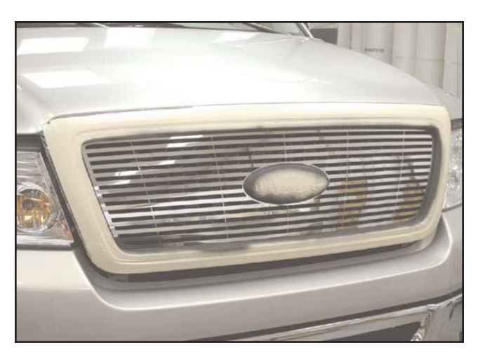
8. Reinstall the E&G grille as outlined in Step 4 .