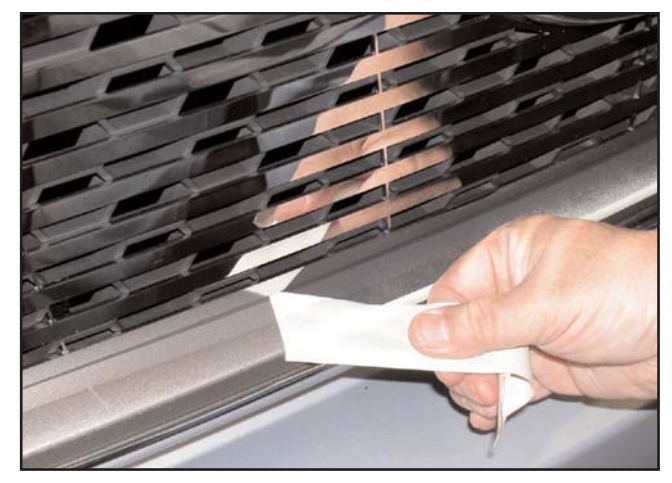
10. Remove the protective masking tape applied to the factory grille surround. Pull the tape back over itself to prevent the tape from tearing. If the grille fits tight and the tape binds, you can pull up on the grille and pull down on the factory grille frame for the added clearance needed to remove the tape.