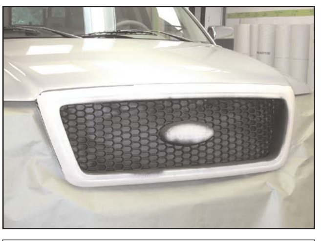
7. Paint the exposed factory honeycomb flat or semi gloss black to conceal it. Make sure you mask behind the grille and over the headlights to prevent paint overspray.