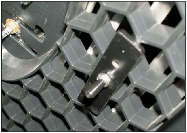
P. Reinstall the thread protectors that came installed on the grille to cover the exposed threads.