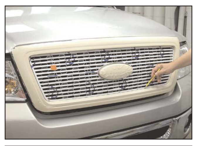
5. For mesh grilles that are black from the factory. proceed to Step 9. If the factory grille insert is not black, draw a line with the edge of the E&G grille, then remove the grille.