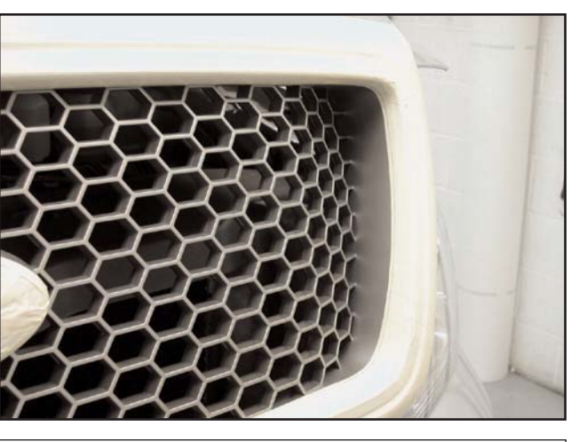
Once the grille is removed, trim the tape 1/8" inside the line drawn in the previous step.