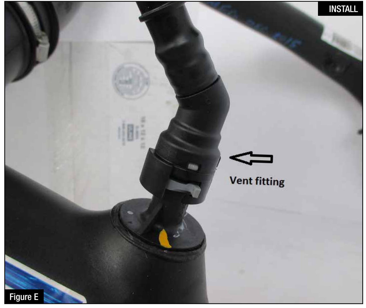
Refer to Figure E for Step 13.

Step 13: Locate the valve cover vent tube that feeds into driver's side turbo inlet. It is not necessary to remove the engine cover.