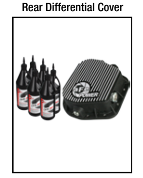
P/N: 46-70152-WL (w/ 0il) 46-70152 (Blk./Mach.) 46-70150 (RAW)