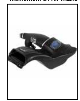
P/N: 51-73115 (PDS) 54-73115 (P5R) 75-73115 (PG7)