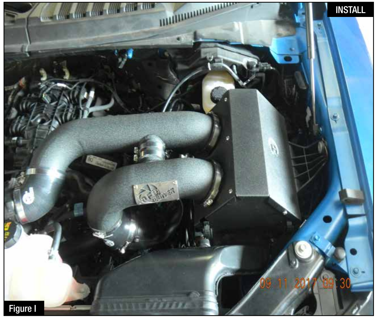
Refer to Figure I for Step 18.

Step 18: Make sure all clamps and screws are tight. Your installation is now complete.