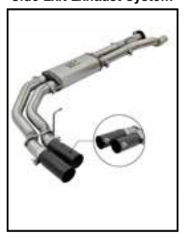
P/N: 49-43091-B (Blk. Tips) 49-43091-P (Pol. Tips)