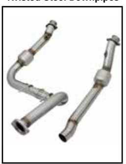
P/N: 48-43020-HC (Street) 48-43020-HN (Race)