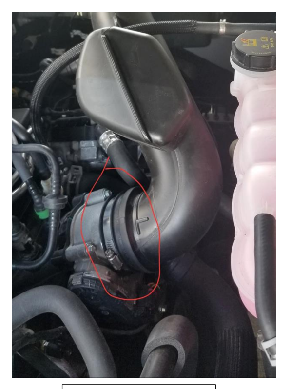
Clamp on Coupler Hose