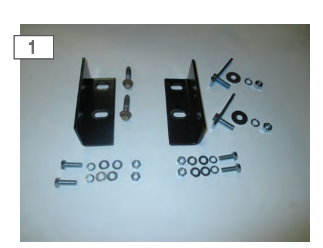
Left side for vehicles with factory tow hooks, Right side without factory tow hooks.