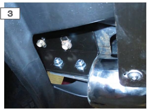
Loosely attach bar brackets to the frame rails. Mount the Bull Bar to the frame brackets securely. Then finish torqueing brackets to the frame rails.

If equipped with tow hooks, remove factory tow hooks. Be careful to keep the bolt plate aligned in the frame.