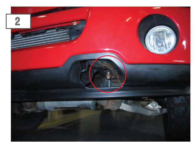
Vehicle with Tow Hooks

If equipped with tow hooks, remove factory tow hooks. Be careful to keep the bolt plate aligned in the frame.