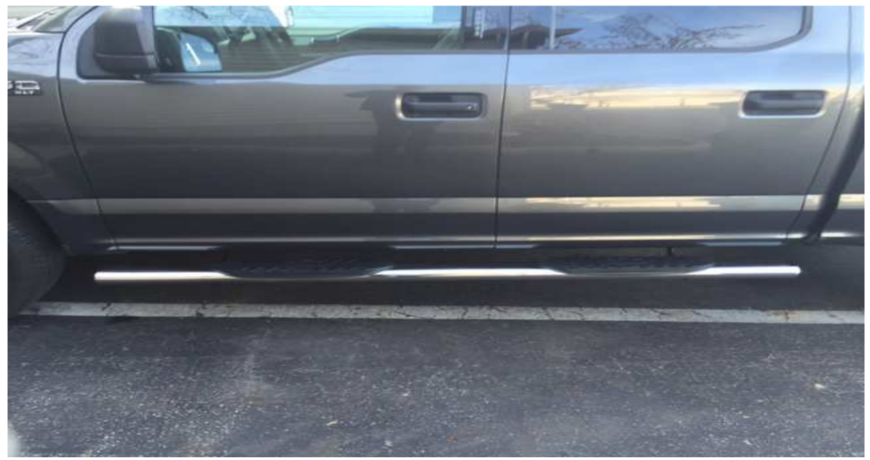
Installation Instructions written by: AmericanMuscle customer Timothy A. Grant 1.28.16

7. Check for level, tighten all nuts using 13mm socket, and enjoy your new sidebars!!