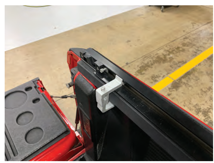
Step 1 \\ Place the rails on the vehicle. Velcro side out with the latch portion of the rail facing the rear of the vehicle.