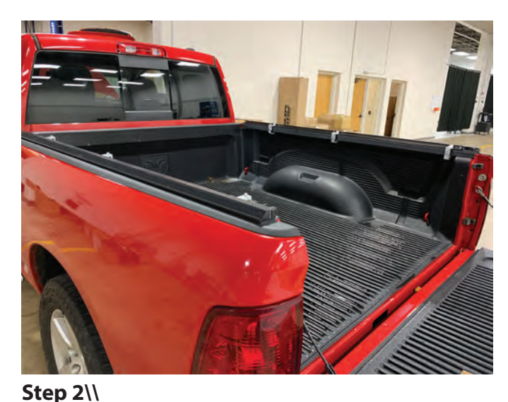
Space the rail clamps evenly over the distance of the bed of the truck. On this application (3) are used on each side. Tighten the clamps enough so that they are secure but leave them loose enough that you can still slightly move the rails. **Note: For Vehicles with utility rails see note at end of install.